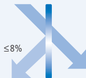
Conventional Float Glass: \leq 8\%